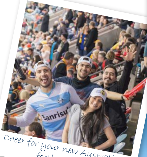
Cheer for your new Australian football team