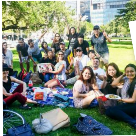
Have a picnic with new friends