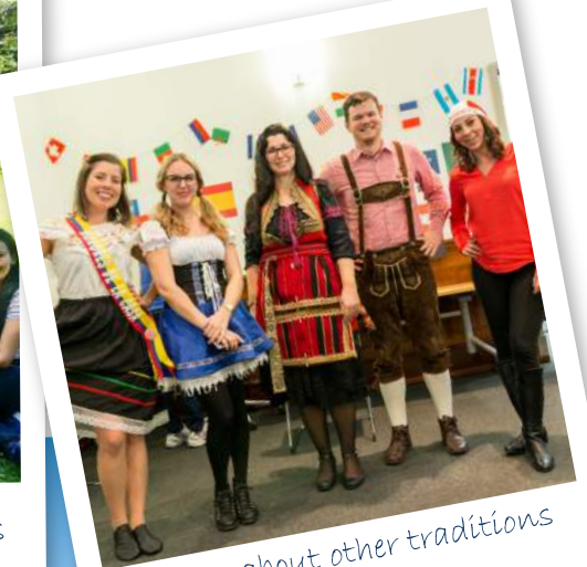
Learn about other traditions and cultures