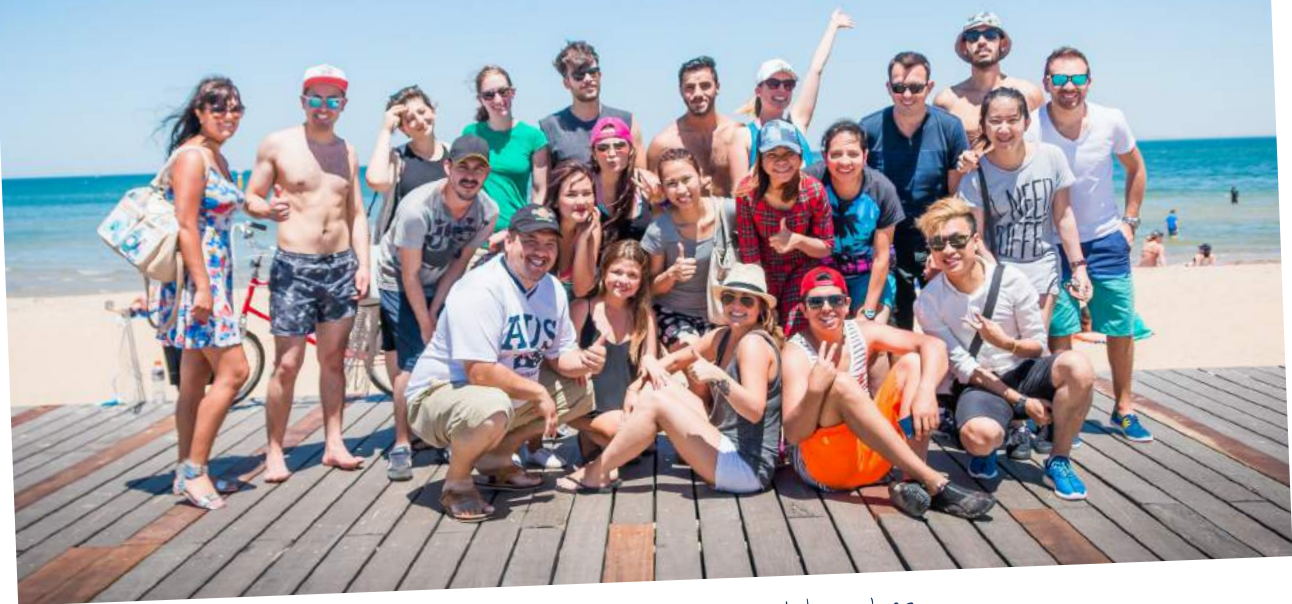
Swim and play volleyball at local beaches