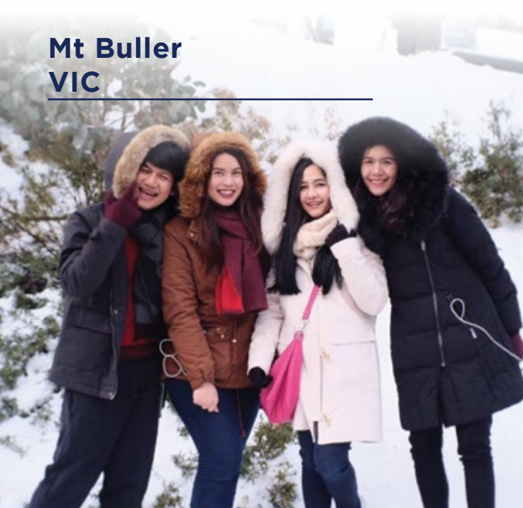
Mt Buller VIC