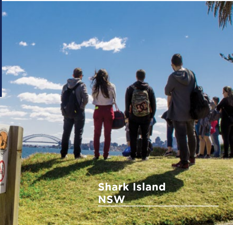
Shark Island NSW

Extended school trips include weekend camping trips to picturesque beach destinations such as Ulladulla, which is just a few hours out of Sydney.