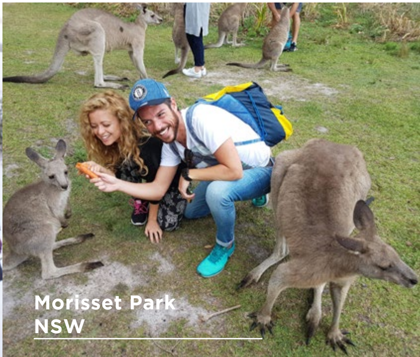
Morisset Park NSW